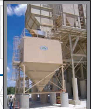
RA-500 offering 25,000 CFM