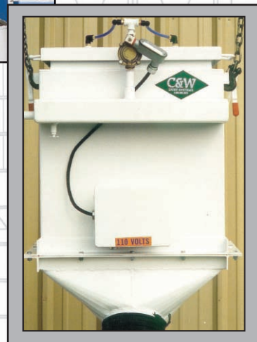
Weigh Batcher - CP-35

C&W Manufacturing P.O. Box 908 Crowley, Texas 76036 1-800-880-DUST www.cwmfg.com